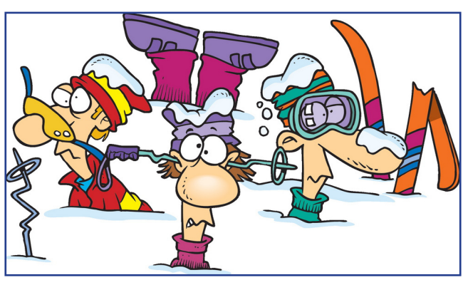
"Perhaps a ski trip was not such a good idea"

with the disease. We are always looking for suggestions for charities to support, so let us know what is important to you.